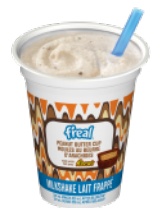
PEANUT BUTTER CUP MADE WITH REESE® PEANUT BUTTER CUPS®