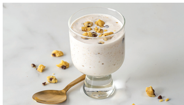
VANILLA + COOKIE DOUGH