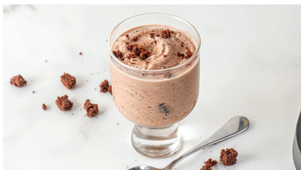
CHOCOLATE + BROWNIE PIECES