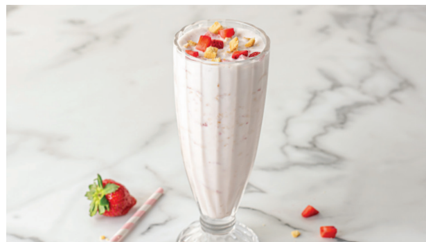
VANILLA + STRAWBERRY JAM OR SYRUP + SHORTBREAD COOKIES