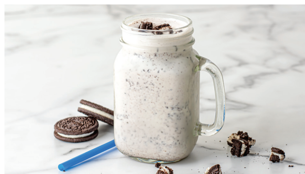
VANILLA + OREOS®