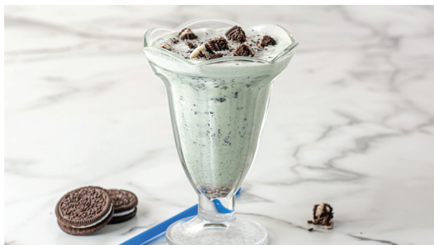
VANILLA + MINT/GREEN SYRUP + OREOS®