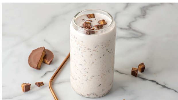
VANILLA + REESE'S® PEANUT BUTTER CUPS